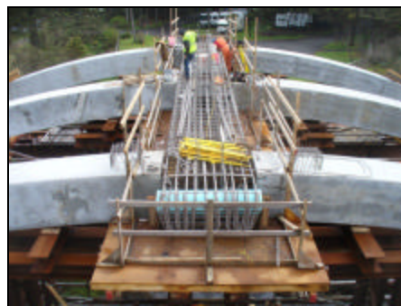
SSR being placed to reinforce deck

The Spencer Creek Bridge, north of Newport, Oregon at Beverly Beach is on the Pacific Coast Highway (US101) and will use approximately 70 tons of 2205 stainless steel rebar (SSR). The bridge is being built to replace a bridge constructed in 1947 that has been closed due to structural problems caused by corrosion.