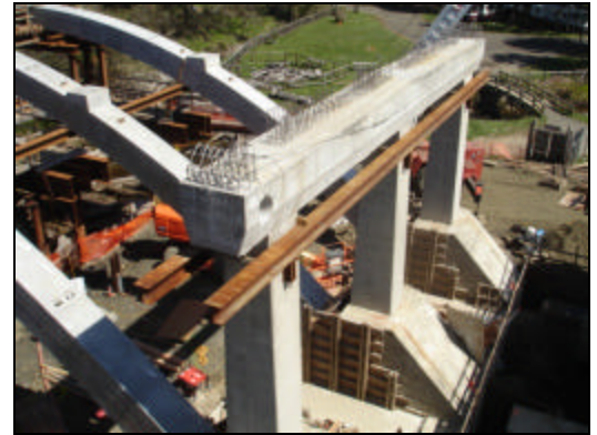
SSR used in bridge superstructure