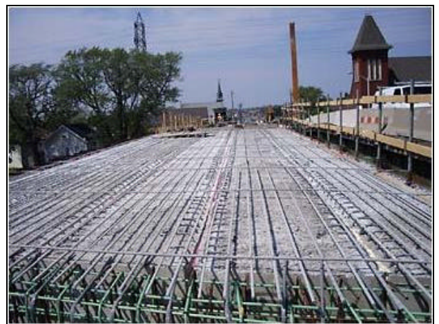
Glass fiber reinforced polymer deck

Salit Specialty Rebar (SSR) shipped the GFRP rebar for fabrication of the deck. SSR was not