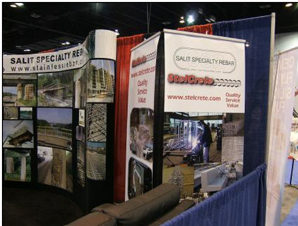
SSR Exhibit at MCPX

Salit Specialty Rebar took its booth to the Colorado Convention Center, Denver at the Manufactured Concrete Products Exposition (MCPX), February 7 to 9. In addition, SSR participated in the education program of the National Precast Concrete Association and presented a paper on Fabricating Reinforcement Cages on Friday, February 8. At its booth, Salit Specialty Rebar representatives demonstrated what is new and improved in their operations and range of products that can benefit clients' production operations.