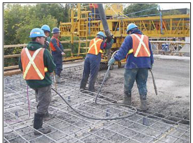
Concrete pour over GFRP

3235 Lockport Road S Niagara Falls S New York S 14305