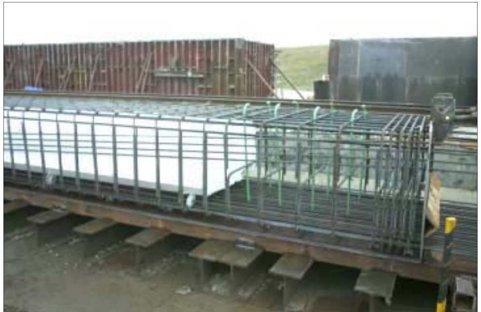
Reinforcing cage for 25 metre long box girder beam