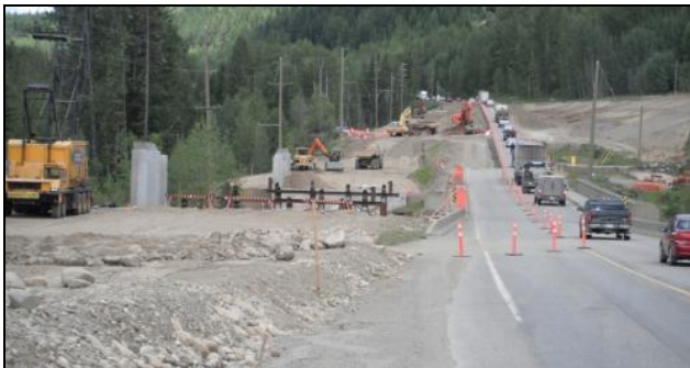
Widening of Highway 97 to four lanes.

The Stone Creek Bridge on the Alaska Highway was replaced with a four-lane bridge using stainless steel rebar in its columns, beams and deck. Built in 1957, the bridge had approached the end of its service life. The project included increasing 1.5km of Highway 97 (Alaska Highway) south of the bridge to four-lanes to connect with the existing four-lane section constructed in 2005 and 2006. Construction was completed in the spring of 2011.