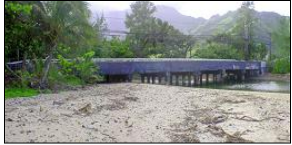
Old Punalu'u Bridge photo.

In 2011, the 83-year-old South Punalu'u Stream Bridge was replaced with a new structure reinforced with stainless steel rebar that will meet vehicular load, safety, and seismic standards. Construction for the project was 100-percent federally funded by the American Recovery and Reinvestment Act (ARRA).