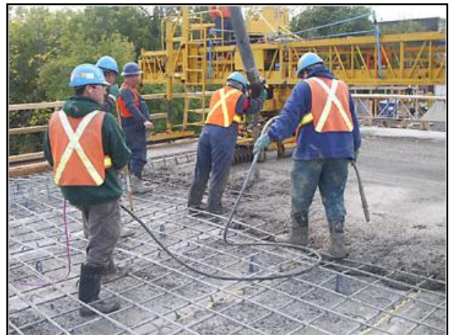
Concrete pour over GFRP