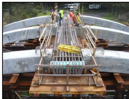
SSR being placed to reinforce deck

The Spencer Creek Bridge north of Newport, Oregon at Beverly Beach is on the Pacific Coast Highway (US101) and will use approximately 70 tons of 2205 stainless steel rebar (SSR). The bridge is being built to replace a bridge constructed in 1947 that has been closed due to structural problems caused by corrosion.