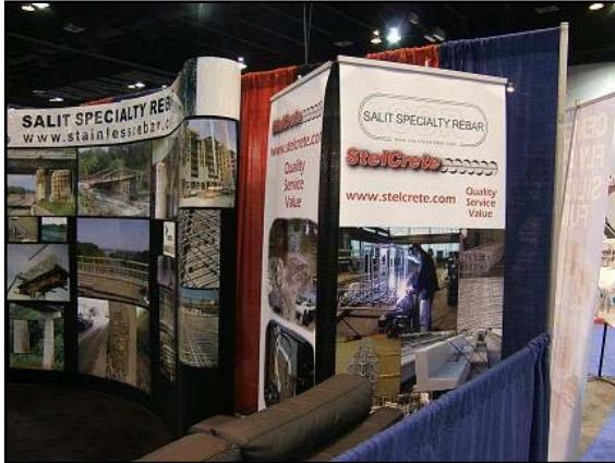
SSR Exhibit at MCPX

pre-welded carbon and stainless reinforcement cages, and examined the fundamental differences between stainless and carbon steel.