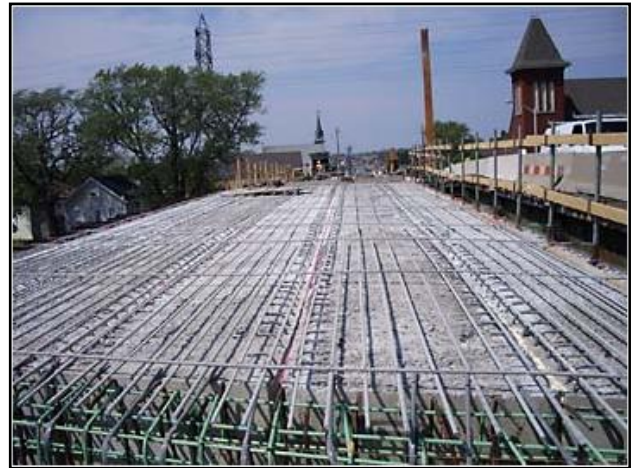
Glass fiber reinforced polymer deck

The construction contract was awarded to Rankin Construction in March 2007, and site work began in April 2007. Construction was completed in April 2008 at a cost of $ 4.5 million.