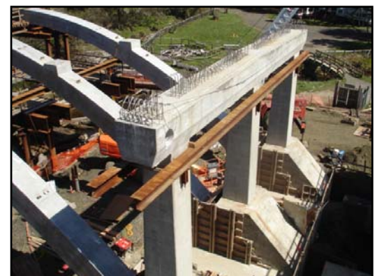
SSR used in bridge superstructure